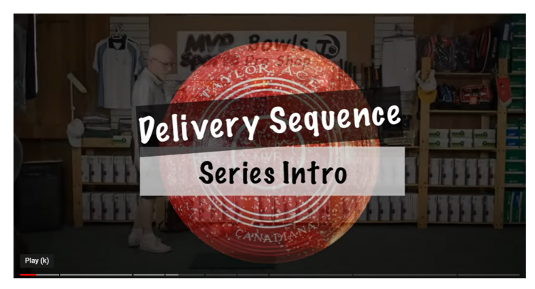
The Delivery Doctor, breaks down the delivery action into bite size sections.