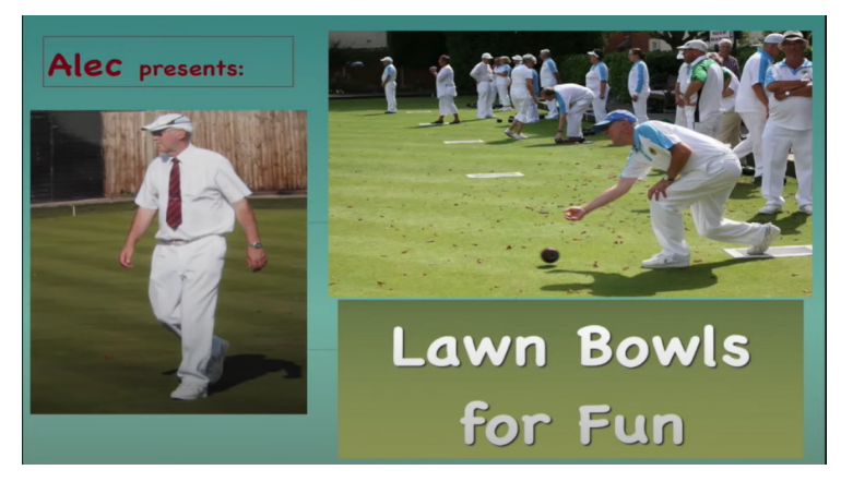
How to play Lawn bowls in easy steps.